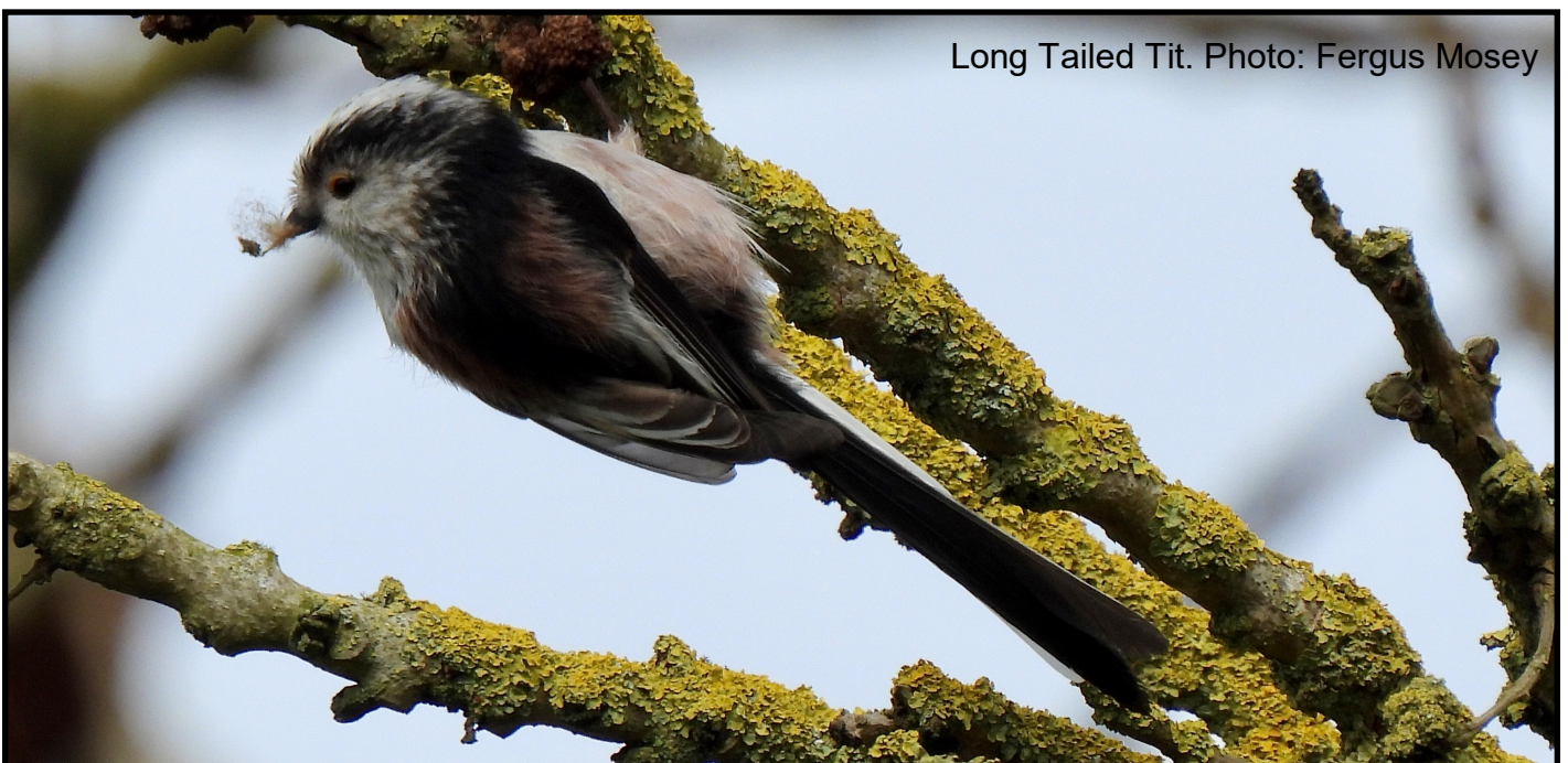
Long Tailed Tit.